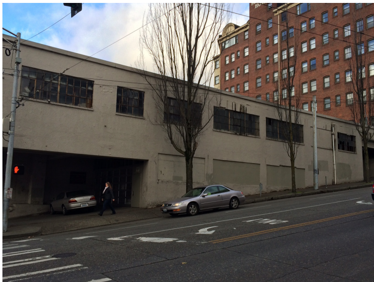
Above: South Elevation