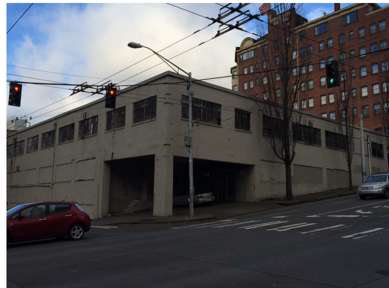
Above: View from Corner