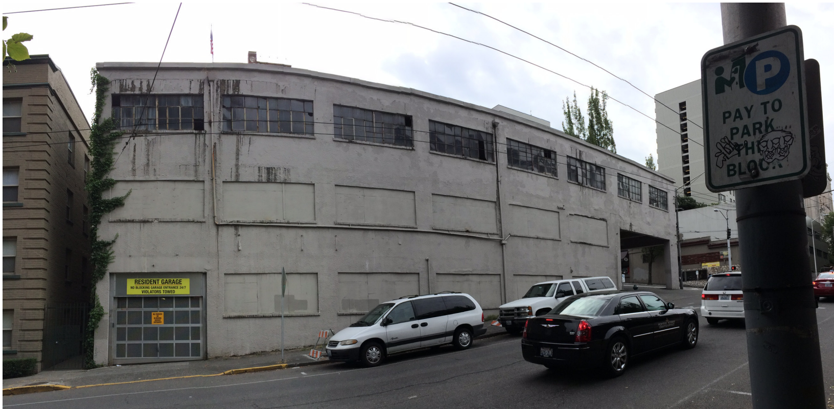
Above: West Elevation